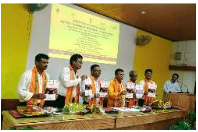
Dignitaries during the Master Training Programme on Black Pepper

Around 100 participants including farmers and officials attended the training. The Hon'ble Minister also distributed planting materials of black pepper, ginger and turmeric to the farmers.