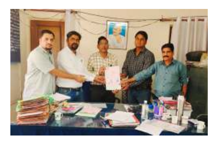
Officials of Spices Board and Jaipur Vidyut Vitran Nigam Limited after signing the agreement

Spices Board and Jaipur Vidyut Vitran Nigam Limited signed an agreement on 15 April 2023 regarding the establishment of a new General Support System (GSS) in Spices Park, Kota, Rajasthan. This will help in establishing industries in Spices Park and provide relief from electric cuts, tripping, voltage fluctuation etc., in Spices Park, Kota.